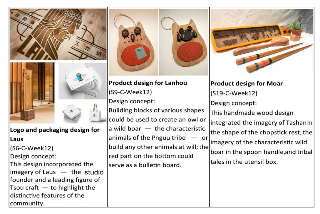
Figure 2. Students' design creations in Phase 2.