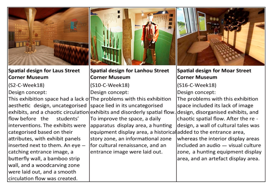
Figure 3. Students' design creations in Phase 3.