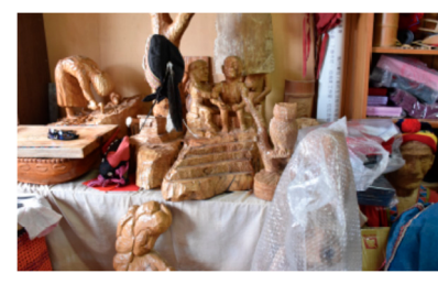
Laus Craft House (TA-Week13-02)